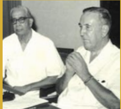
Hon'ble Ambassador of USA, Mr. Chester Bowles delivering a lecture to the participants