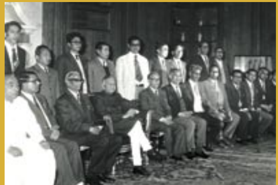
President, Dr. Fakhruddin Ali Ahmad (fourth from left) with participants of three-month training course for North-Eastern States, 1976