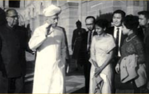
Participants of the second course with Dr. S. Radhakrishnan