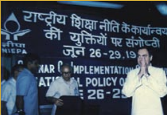
Prime Minister, Shri Rajiv Gandhi at National Seminar on Implementation of New NPE, 1986