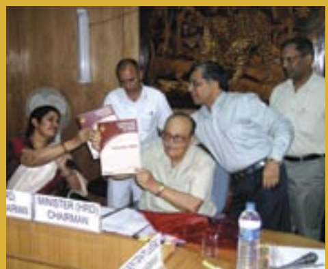
Hon'ble Union Minister for HRD, Shri Arjun Singh releasing District Report Cards of Elementary Education in India