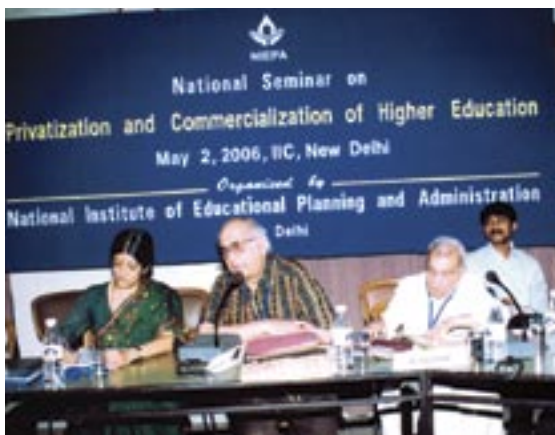
National Seminar on Privatization and Commercialization of Higher Education

Ph.D. students shall be evaluated twice in the first semester; once, at the end of the three-month orientation course work, and then, at the time of presentation of the draft Ph.D. synopsis in the faculty seminar to be organised towards the end of the first semester. Assignments will be given to each student in the form of term papers, which will be evaluated for award of credits. Each term paper shall be of not more than 5000 words.