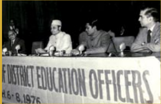
Education Minister, Dr. Karan Singh at All India Conference of Districts Education Officers (DEOs), 1976