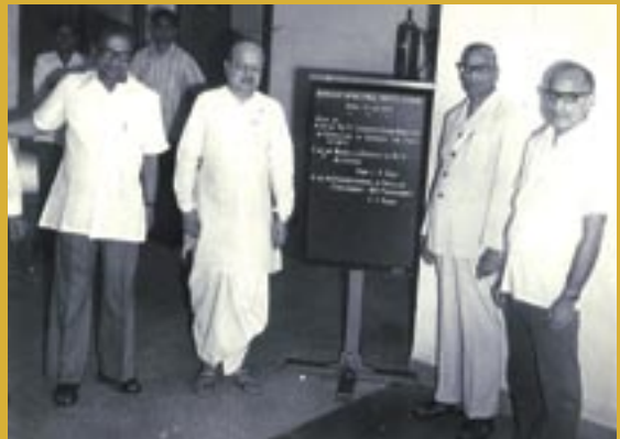
Union Minister of Education, Dr. P. C. Chunder at a workshop on National Service Scheme, 1978