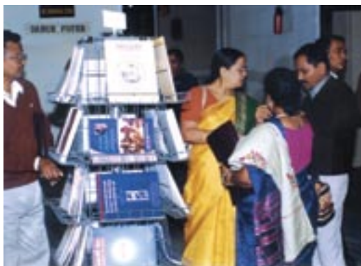
NUEPA's publications on display

The University has a well established library and documentation center, publication unit, computer center, electronic data processing unit and a cartography cell. Candidates admitted to the Ph.D. programme shall have access to all such facilities in connection with their Ph.D. work.