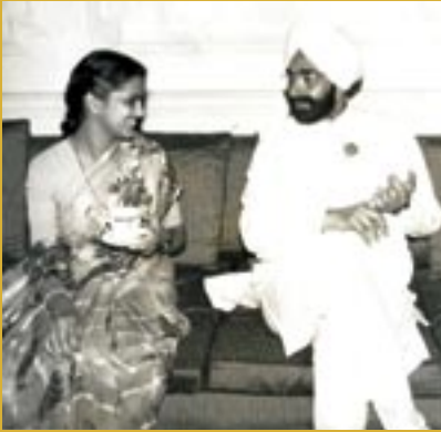
President, Shri Gyani Zail Singh, interacting with the staff of NIEPA