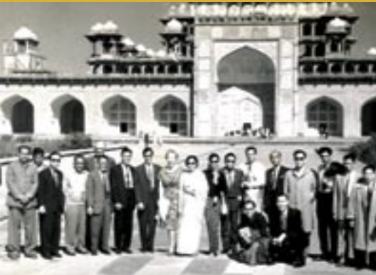
Participants of second course (Dec. 1962 to March 1963)