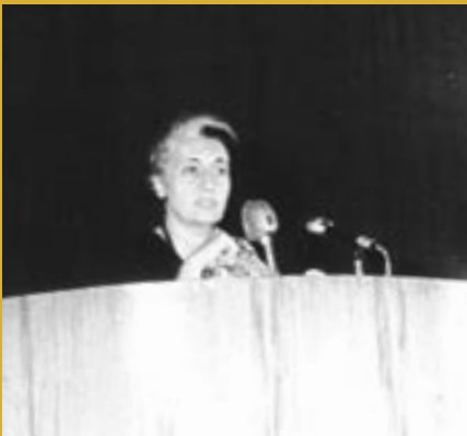
Prime Minister, Smt. Indira Gandhi addressing the All India Conference of DEOs, 1976