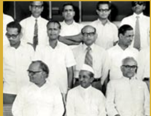
Vice President, Dr. B. D. Jatti (front row, centre) with participants and faculty of National Staff College