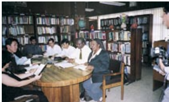
Foreign Trainees at the NUEPA Library