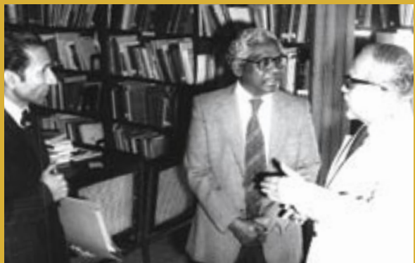
Dr. K.R. Narayanan at an Orientation Programme on Educational Planning and Administration for College Principals