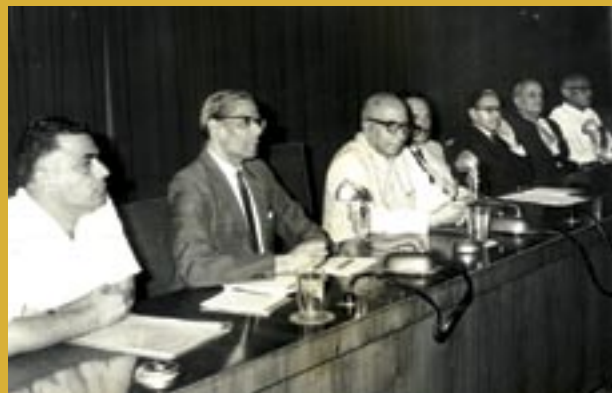
Dr. Triguna Sen (third from left), Union Education Minister, inaugurating the ninth course