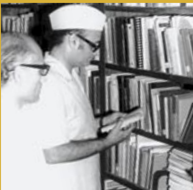
Education Minister, Dr. Karan Singh on a visit to NIEPA Library, 1979