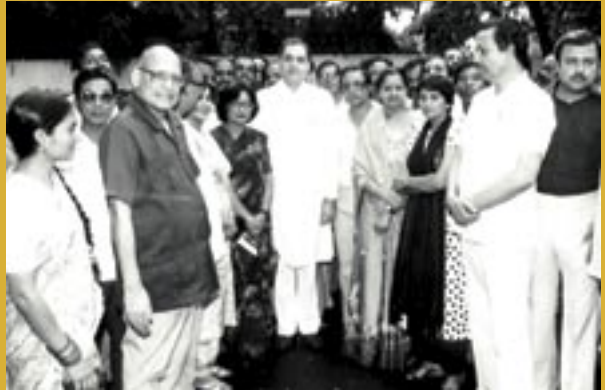
Prime Minister, Shri Rajiv Gandhi with the NIEPA staff and DEPA participants