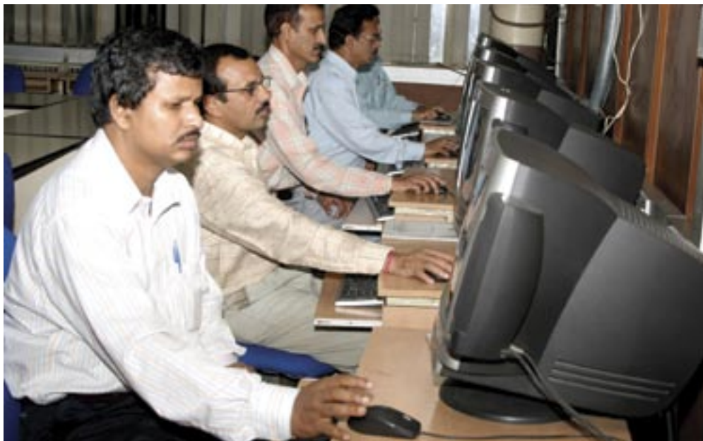
NUEPA Trainees at work in the Computer Lab

seminar to be organised during the third month of the second semester. The final version of the synopsis, duly approved by the supervisor(s) has to be submitted latest by the end of the second semester. This will be a necessary condition for confirming the registration of the full-time Ph.D. candidate.