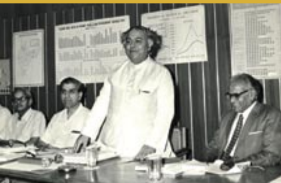
Prof. S. Nurul Hasan inaugurating the training course