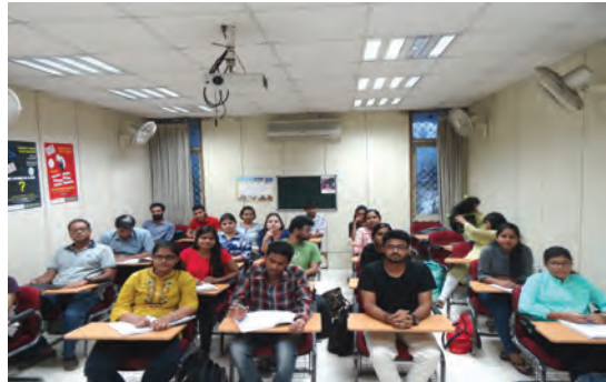
M. Phil. and Ph.D. Candidates taking Examination

These programmes are designed to build the research capacity of scholars from varied backgrounds and provide a strong knowledge and skill base in related areas of educational policy, planning, administration and finance. The research studies completed under the M. Phil. and Ph. D. programmes are expected to make significant contributions in enriching the knowledge base, besides providing critical inputs for policy formulation, implementation of reform programmes and capacity building activities. The broad areas of research, covering school and/or higher education are as under: