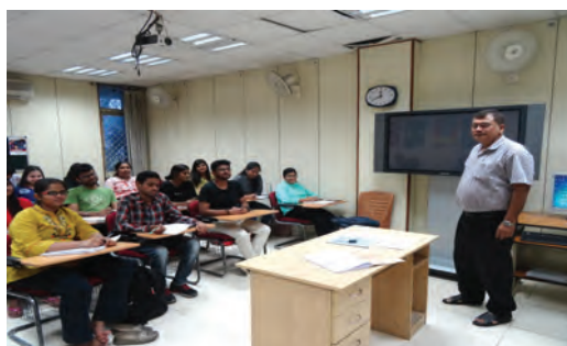
M. Phil. and Ph.D. Scholars

The scholars registered for Ph. D. Programmes will work on an approved topic and submit the thesis under an identified supervisor. After satisfactory evaluation, successful scholars shall be awarded Ph. D. degree.