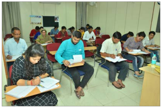
M. Phil. - Ph.D. Candidates taking Examination

and provide a strong knowledge and skill base in related areas of educational policy, planning, administration and finance. The research studies completed under the M. Phil. and Ph. D. programmes are expected to make significant contributions in enriching the knowledge base, besides providing critical inputs for policy formulation, implementation of reform programmes and capacity building activities. The broad areas of research, covering school and/or higher education are as under: