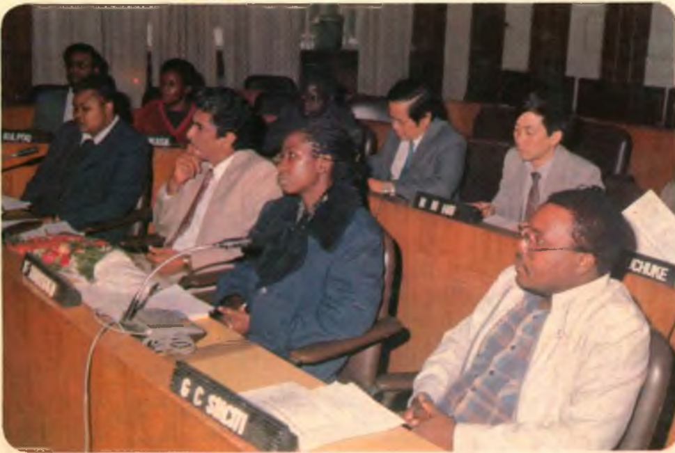
A Session of International Diploma Programme in progress