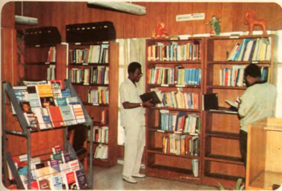
A View of NIEPA Library