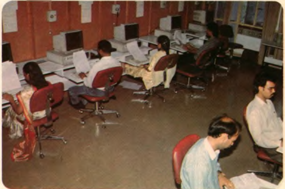
A Section of the Institute's Computer Centre