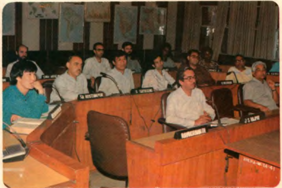
UNESCO sponsored International Training Seminar on Environmental Education for Educational Planners and Administrators organised by the Institute