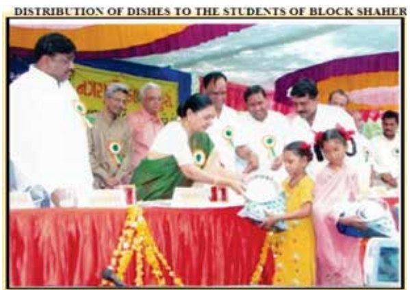
DISTRIBUTION OF DISHES TO THE STUDENTS OF BLOCK SHAHER