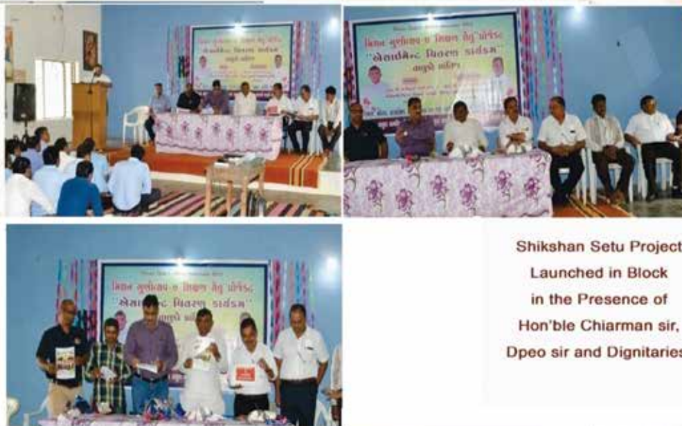
Shikshan Setu Project Launched in Block in the Presence of Hon'ble Chiarman sir, Dpeo sir and Dignitaries.