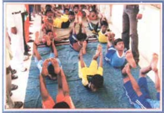
CHILDREN ARE DOING YOGASAN DURING TALUKA LEVEL RAMATOTSAV ( SPORTS FESTIVAL )

The officer also motivated teachers to participate in blood donation camps and fulfill their social responsibility.