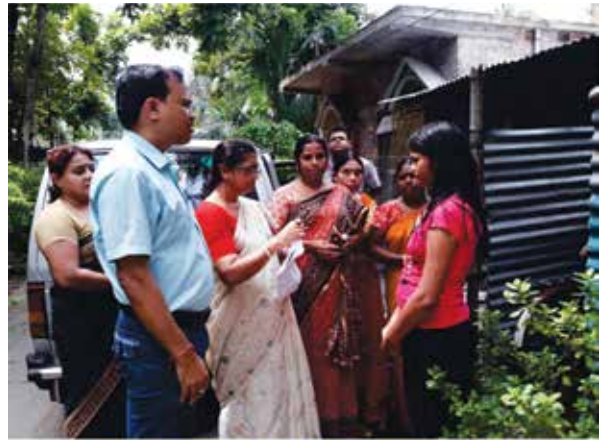
HOME VISIT WITH DROP OUT PREVENTION CLUB

Dropout Prevention Club. At an interval of every two weeks, para teacher visit every class and section of the school and take report from the students about the frequent absentees of the school. Dropout Prevention Club then conducts a meeting in the residence of the student along with his/her parents, preferably before the tiffin time of the school to convince the students to attend the school.