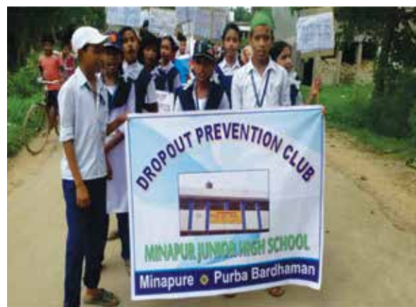
AWARENESS CAMPAIGNING OF DROPOUT PREVENTION CLUB

In order to execute the innovation, Dropout Prevention Clubs comprising of Head Teacher, Assistant Teachers, VEC/SMC members, Para Teachers and SHG Members were formed. Regular surveys were conducted. Legal or judicial support to resume dropout children was taken. Every effort was made to help the drop outs mingle with the main stream educational system. The job is mainly undertaken by a team of para teachers in association with all other co-workers of the