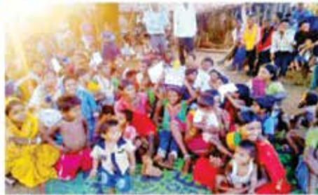
बैंगलूरुन, आदिवासी के बीच शिक्षा।