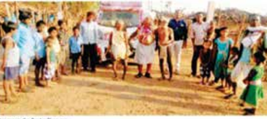
बैंगलूरुन क्षेत्र में शिक्षा रथ।

शिक्षा रथ बच्चों को जागरूक करने के लिए है, जहां के बच्चों को प्राथमिक, मध्यम और उच्च शिक्षा तक पहुंचाने के लिए है। शिक्षा रथ को सफल बनाने के लिए समाज के प्रति जागरूकता बढ़ाने की जरूरत है।