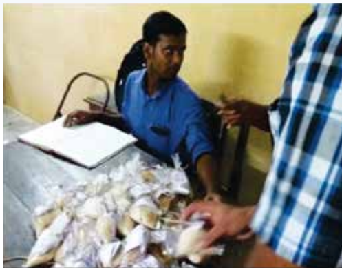
Sampling of Food grain by FCI during lifting of rice by distributor.

Awareness generation: All possible methods were adopted for awareness generation. IEC materials containing different information on Mid Day Meal Scheme like Posters, Hoardings, and Flexes were developed. Posters were pasted on the wall of each and every school; Hoarding was affixed at each and every SDO office, BDO office, Municipality, and DM office. Flexes were hung up at prominent places. Tableau was arranged for every Subdivision which ran all over the district. Beside IEC, some other interactive tools like different level meetings, talking with students, cooks, parents were used to generate awareness. Colorful processions were organized by the students at village level, block level, municipality level to aware the masses about the benefit of MDM.