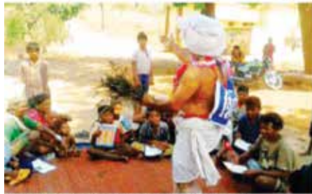
बैंगलूरुन क्षेत्र में कटप के जरिये लड़कों को शिक्षा का उद्देश्य बताने वाला शिक्षा रथ।