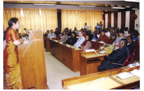
Smt. D. Purandeswari, Hon'ble Minister of State for Human Resource Development addressing IDEPA participants

Diploma Course in Educational Planning and Administration (DEPA) and International Diploma Course in Educational Planning and Administration (IDEPA). The university is well equipped in terms of basic infrastructure to promote teaching and research. It has modern classrooms, state of the art ICT labs with internet connectivity, modern gym, etc.