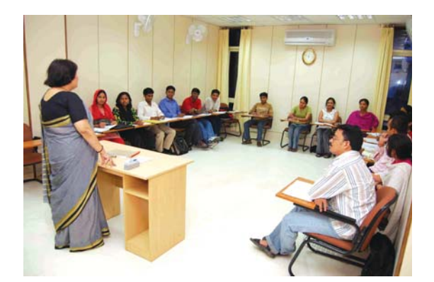
AView of M. Phil. - Ph. D. Classroom

The course work of the Full-time Integrated M. Phil. - Ph. D. and the Direct Ph. D. programmes will be assessed through Continuous and Comprehensive Evaluation (CCE) which will be based on multiple sources, criteria and techniques of assessment. It would provide enough feedback and space for improvement. Scheme of Evaluation will involve assessment on the basis of Seminar