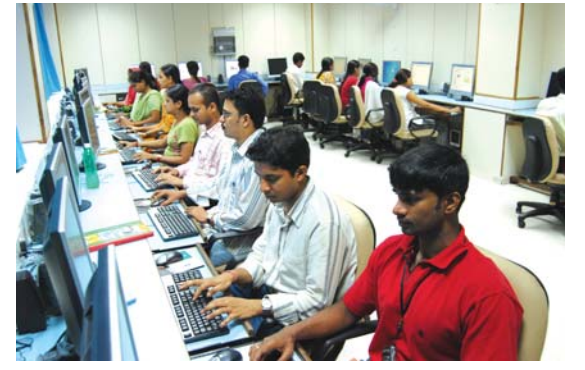
Research Scholars working in ICT Lab

Besides providing an idea regarding the area of research proposed to be pursued by the candidate, the writeup may also be used by the University as one of the parameters for initial short-listing of applications. It may be underlined that applications having the brief write-up not related to any of the research areas mentioned in the Prospectus would be rejected in the initial stage of screening.