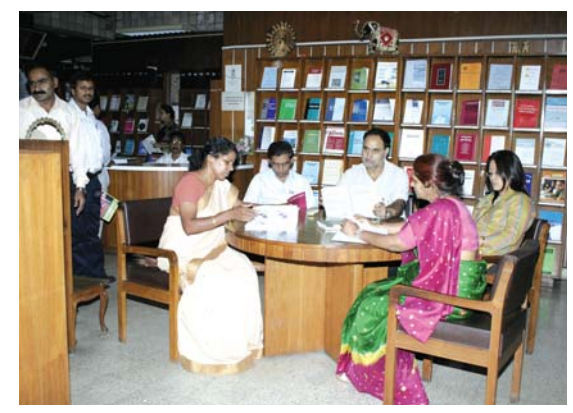
Participants in NUEPA Library

(e) All the three programmes will be governed by the rules and regulation of the National University of Educational Planning and Administration.