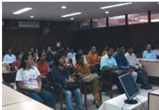
Ph.D. Scholars at the beginning of session

Coursework is not mandatory for the scholars admitted to the Part-time Ph. D. Programme. However University reserves the right to recommend attendance and completion of the part and /or whole of the course work on case to case basis. Once registered for Ph. D. Programme Scholars will work on an approved topic and submit the thesis under an identified supervisor. After evaluation successful scholars shall be awarded Ph. D. degree.