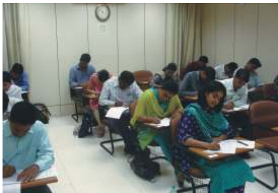
M. Phil./Ph. D. Admission Test