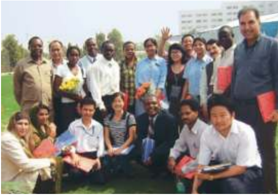
International Participants on a field visit

Educational Planning and Administration (DEPA) and International Diploma Course in Educational Planning and Administration (IDEPA). The university is well equipped in terms of basic infrastructure to promote teaching and research. It has modern classrooms, state of the art ICT labs with internet connectivity, modern gym, etc.