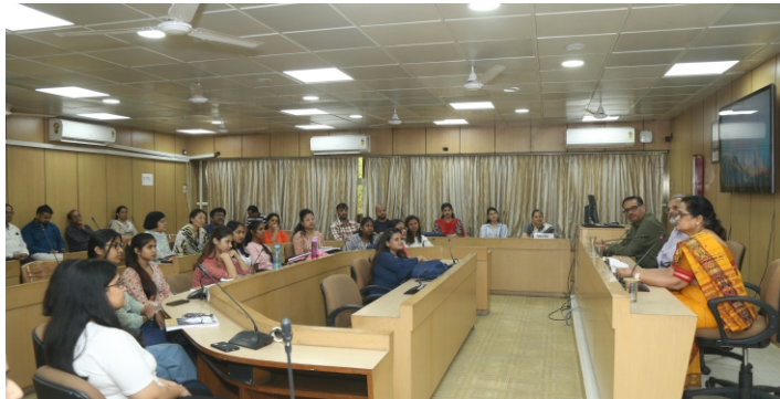
NIEPA Scholars Interaction Programme