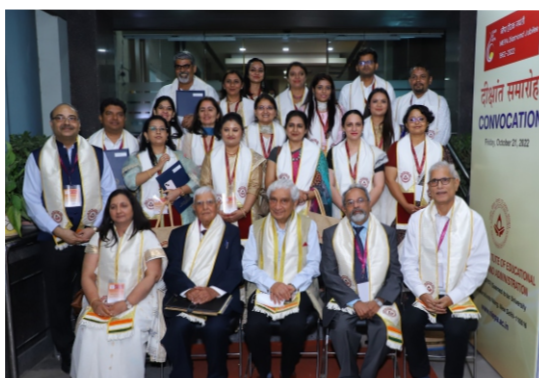
Convocation October 21, 2022

The scholars registered for the Ph.D. Programme will work on an approved topic and submit the thesis under the allocated supervisor. In accordance with the UGC guidelines each scholar will be assigned a Research Advisory Committee (RAC) consisting of internal and external experts. The RAC will provide regular guidance to the doctoral candidates. In addition, teaching programs at the NIEPA will provide inputs on Research Methodology and Ethics, conceptual and thematic inputs.