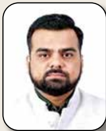
Programme Deputy Director